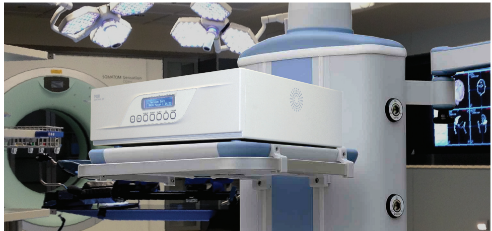
Control OR's small footprint allows it to be positioned for maximum efficiency.

Specifications are subject to change with or without notice. Doc. # FSN1924 Rev.08/14