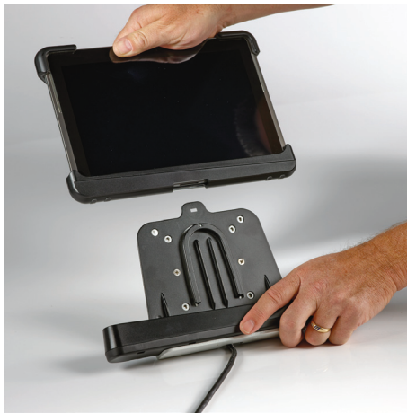
The tablet can be disengaged from the mounted docking station for portable control.