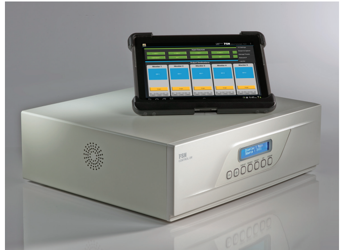
Harness the power of Control OR, wirelessly, throughout the operating room, by using the intuitive interface on FSN's touch screen tablet. A secure docking station is available to hold and charge the tablet.