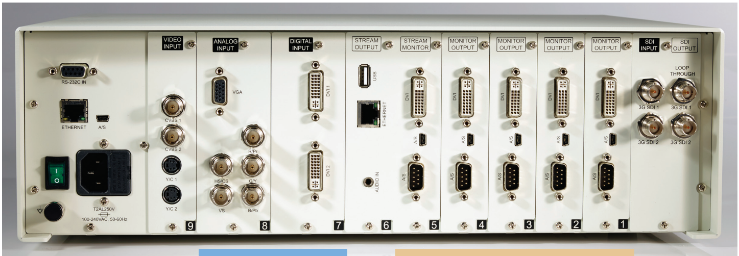
Input signal substitutions available